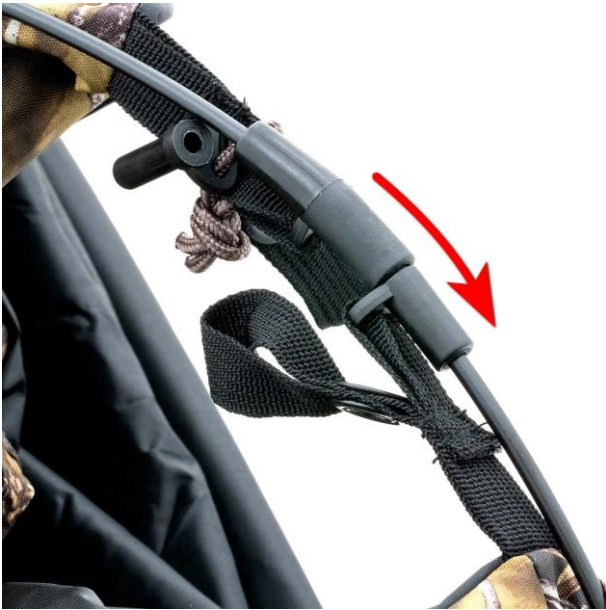
Photo 1, carefully pull the ends apart.