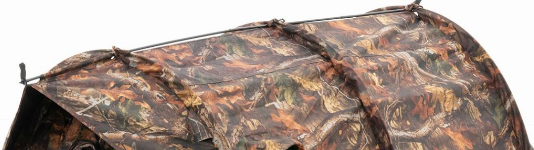
Photo 3, assemble the fiberglass pole (4 parts) and slide it through the openings

Attach it to the tent's "ribs" using the cords attached to the roof of the tent.