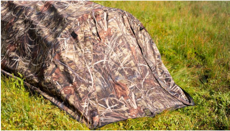
Photo 8, the entire tent is now protected by the rain cover.