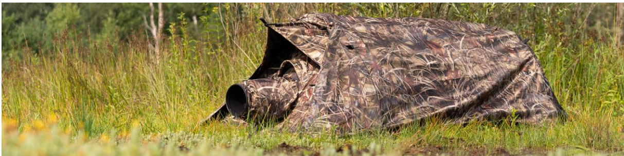
Using the tent with the rain cover, only the front lens opening can be used.

Then secure the last piece of the fibreglass pole and reattach the canopy. This will allow you to use the canopy again. The canopy can be used as normal, but we recommend closing the two small viewing windows on the outside to prevent water from entering. This allows you to use the front lens opening while staying dry inside the tent. In this case, you only use the viewing hole just above your camera (which has its own little roof).