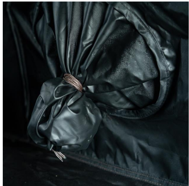
Photo 4 & 5, close the snoots you don't use with the cord and cord stopper outside/inside the hide