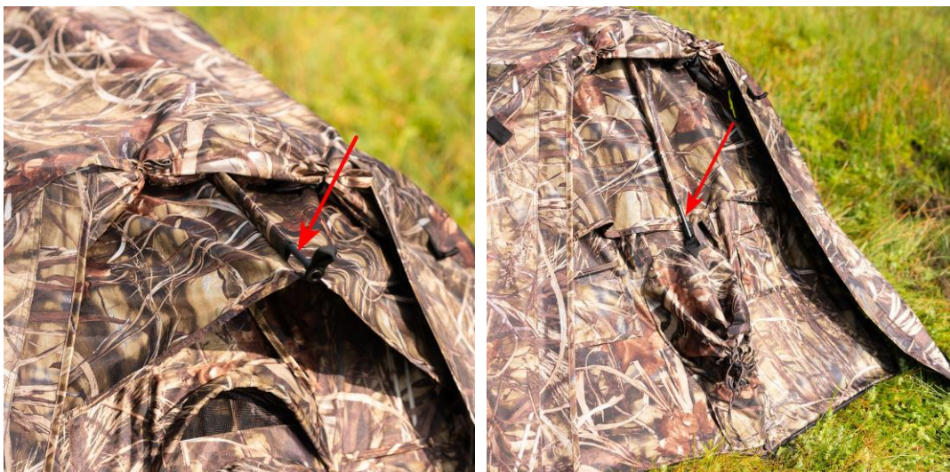
Photo 6 & 7, detach the last section of the fibreglass pole of the hide and let it hang down

First, detach the last section of the fibreglass pole at the front of the hide and just let it hang down (photos 6 & 7). Then pull the cover lengthwise over your Falco tent with the zippers closed . Next, secure the cover at each corner with the included pegs, so that the cover is tight over your tent. You can then use all the other loops to further secure the rain cover. If necessary, you can even use the guy ropes to tie everything down even more securely. When the cover is properly stretched over the tent, the zips at the front and back are neatly in place.